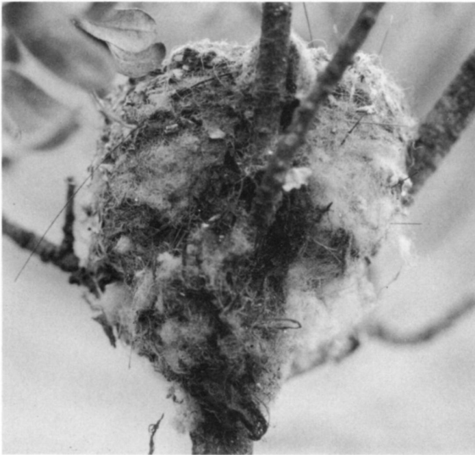
Fig. 2. An Elepaio ( Chasiempis sandwichensis ) nest containing sheep wool from Puu Laau, Hawaii.

inside or outside the sheep enclosure at Puu Laau (Table 2). All live and dead sheep were removed from the enclosure in 1967, but as wool is an enduring material some probably still remained snagged on branches, but in very small quantities when compared to the outside. No wool was present in any Melodious Laughing-thrush, Red-billed Leiothrix, Skylark, Spotted Munia, or Cardinal nest. Light usage was found in the House Finch and heavy usage again occurred in the Palila, Amakihi, and Elepaio. The difference in the utilization of wool by endemic birds inside and outside the enclosure was significant ( X_c^2 = 7.92 , df = 1 , P < 0.01 ), but introduced birds showed no difference inside and out ( X_c^2 = 0.18 , df = 1 , P > 0.50 ).